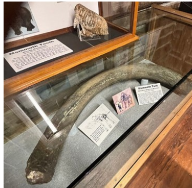
This mammoth tooth and mammoth tusk are part of the natural history display at the Fort Museum and Frontier Village in Fort Dodge, Iowa.

Our club will be doing volunteer work for the Fort Museum and Frontier Village in Fort Dodge by cleaning and relabeling the rock and mineral collection on display. The display is housed with Fort Dodge's Cardiff Giant.