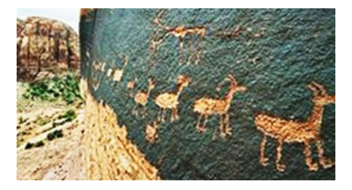
Petroglyphs near Moab, Utah.

Now the clouds grow dark and are messengers of rain, They bring a breeze scented with sage over the terrain. An eagle soars as a guardian above the canyon below Over messages in stone only the ancients truly know.