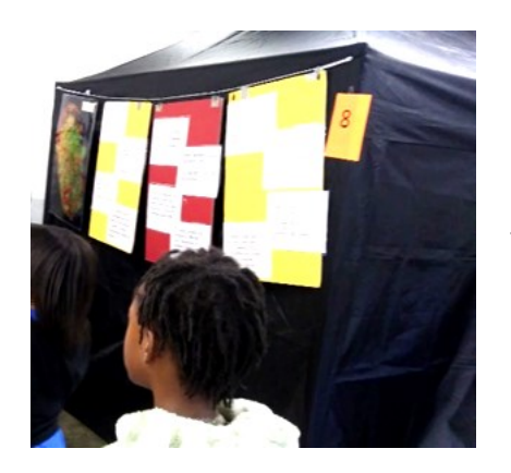
Black tent for fluorescent room.

If you see any of this being offered for sale, please get a screenshot right away with the name of the seller shown. Then call the Fort Wayne Police Department at 260-427-1340 with Control Number 24F135103. Please also let the club know via email, 3riversgms@gmail.com. Thank you.